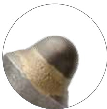
(D) Dome carbide

Available with shark teeth or conical cutters with aggressive or dome carbides to cover a variety of tough ground conditions