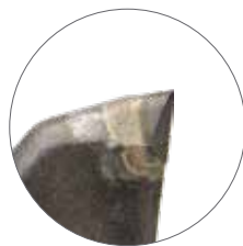
(S) Sharktooth carbide