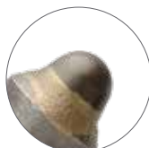
(D) Dome carbide

Available with different carbide cutter options