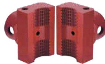
Cylinder Side Breakout Jaws: Breakout wrench replacement jaws