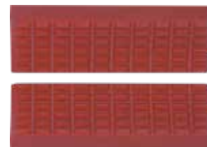
Breakout Jaw Inserts: High quality replacement jaw inserts