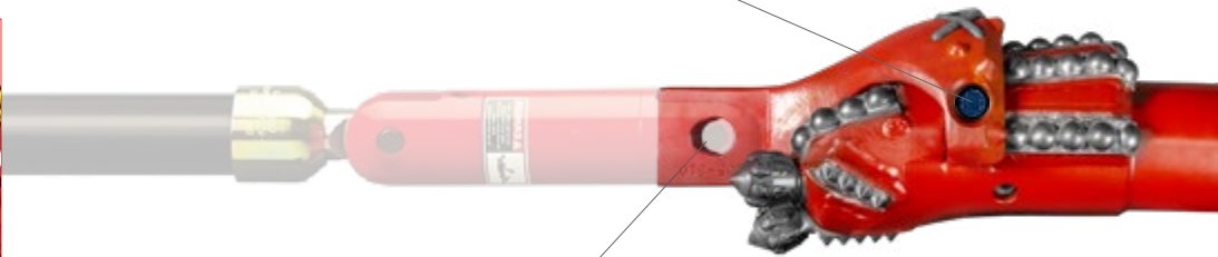
Attach, and hold in line, a swivel for direct pullback