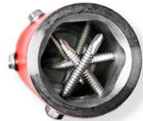
Available Size Configurations