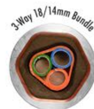
MDP-7W-18/14 Puller + MDP-3W-18/14-SPACER

DRILLHEAD SYSTEMS HOUSINGS BITS & BLADES QUICK-DISCONNECTS REAMERS SWIVELS PULLERS ADAPTERS & SUBS REPLACEMENT PARTS