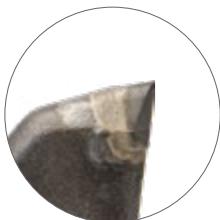
(S) Sharktooth® carbide