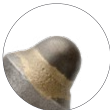
(D) Dome carbide

Available in these cutter tooth options: